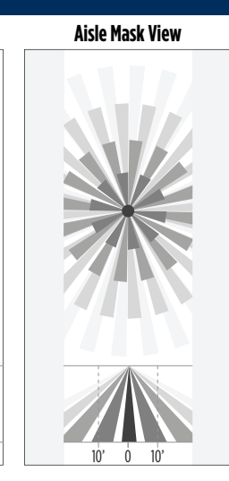
Top & Side View at 8 ft. 25' 20' 15' 10' 5' 0 5' 10' 15' 20' 25' 0 4' 8' <u>25' 20' 15' 10' 5' 0 5' 10' 15' 20' 25'</u>