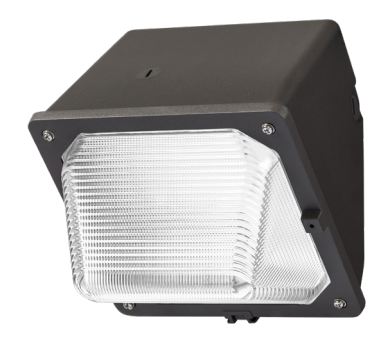
A TESTED IN USA

Photo Control: For factory installed 120V button photo control add suffix PC to part number.